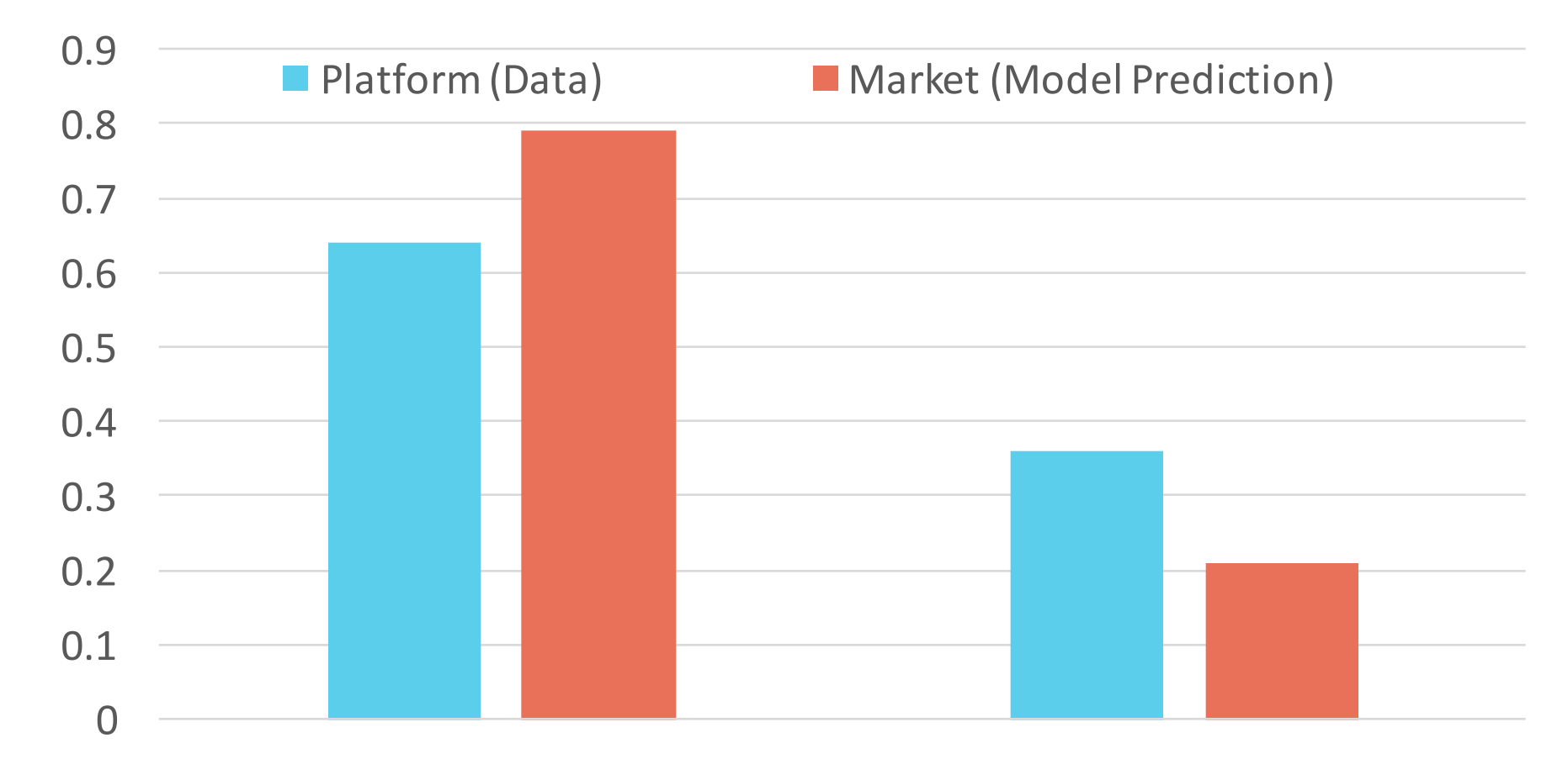
Fig. 2: Maturity Contract Choice